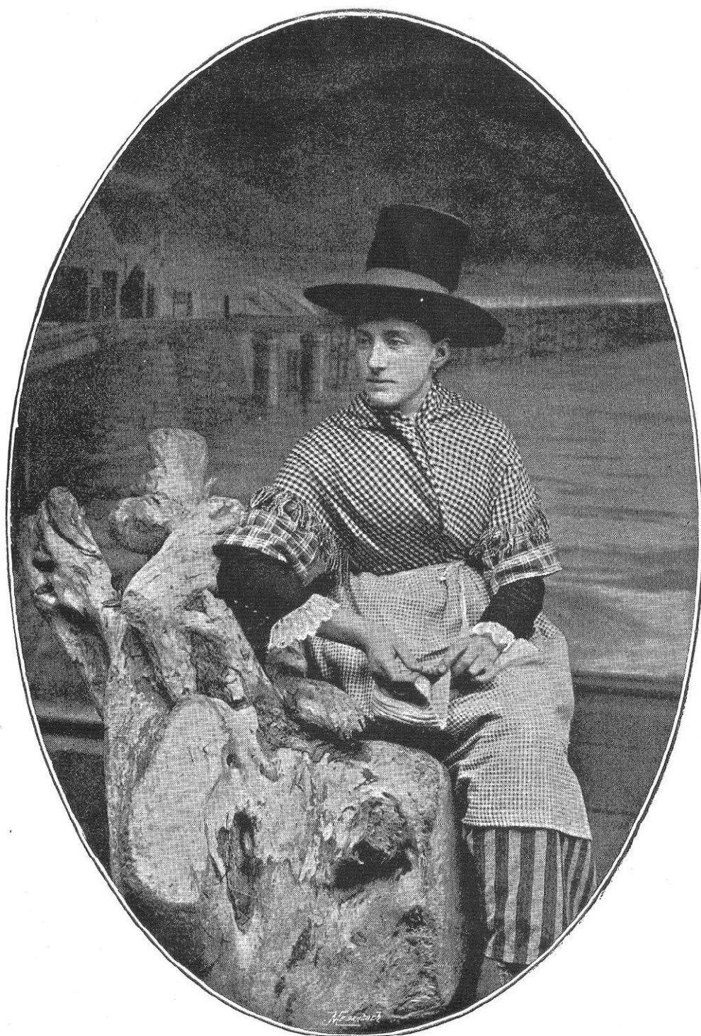
BONEDDIGES GYMREIG.