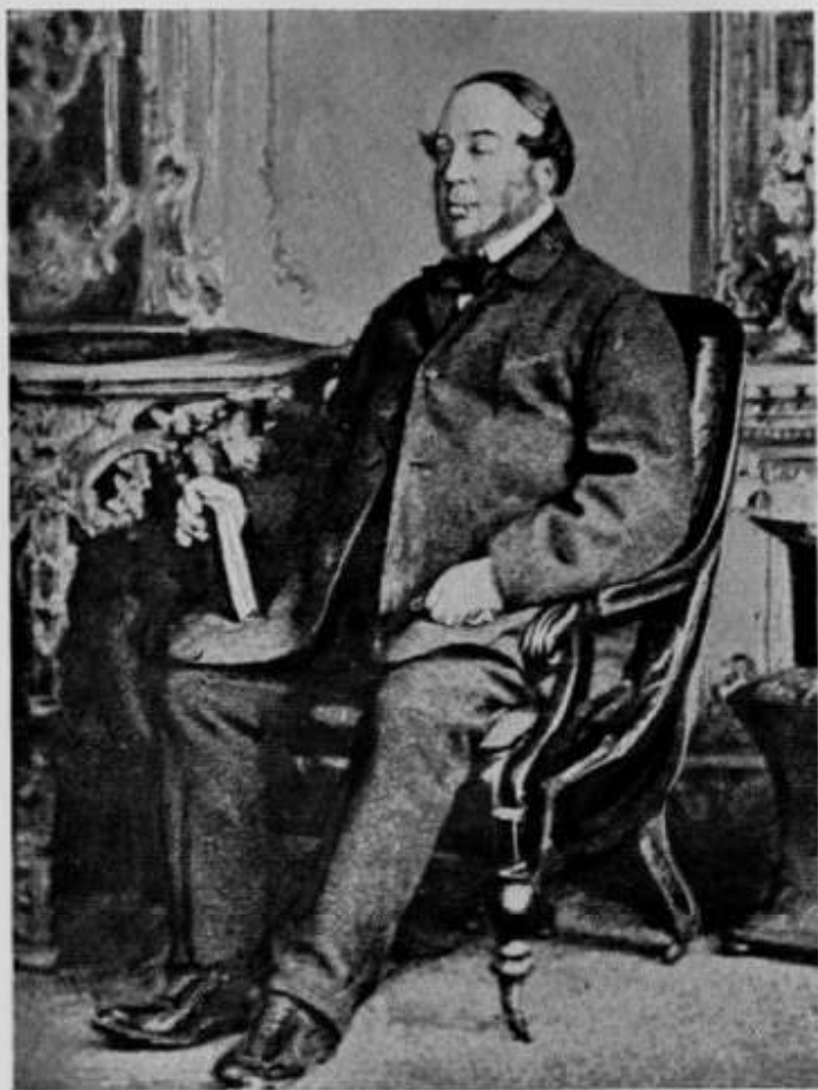
George Shillibeer, the originator of the London Bus