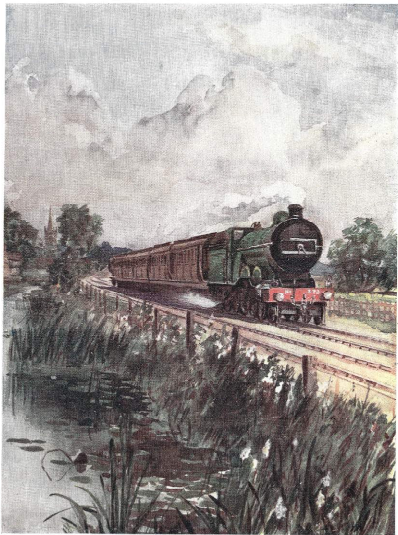
A GREAT NORTHERN TRAIN ON THE MAIN LINE NEAR HUNTINGDON.

The country passed through in this part of the journey to York is very flat, but the scenery is often picturesque, especially where it runs by the Ouse.